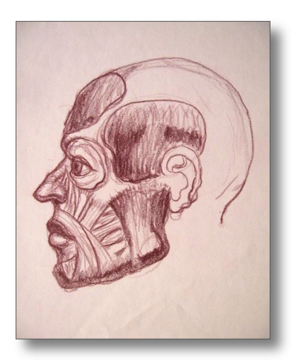
Drawing by Josh Parken

"They're learning the names of the muscles and how they work. They're also focusing on mathematical proportion. Just seeing the work from the kids, I'm amazed at what talented kids we have."